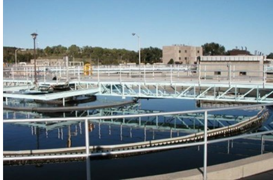
CSU Wastewater Treatment Plant

This month's newsletter will focus on how we provide sewer service. It is our goal to provide our customers with continuous, safe and reliable sewer service. There are two major components to providing service; Wastewater Collection, and Wastewater Treatment.