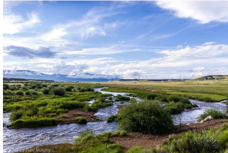
HEADWATERS OF THE ARKANSAS

The week of May 6th–12th has been declared National Drinking Water Week. For more than 40 years the American Water Works Association (AWWA) and its members have celebrated Drinking Water Week – a unique opportunity for both water professionals and the communities they serve to join together in recognizing the vital role water plays in our daily lives. Please join AWWA and the Stratmoor Hills Water District as we celebrate drinking water! This year the theme is "Protect the Source".